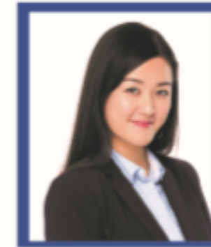
Photo ถือเป็นสิ่ง สำคัญในการกรอก เอกสารสมัครงาน